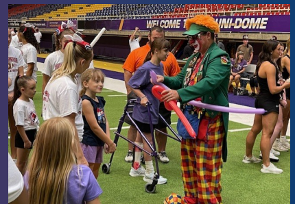
Lucky the Clown