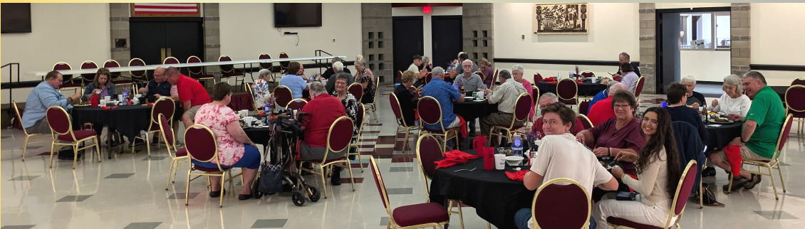
Quarterly Birthday Dinner September 8, 2024