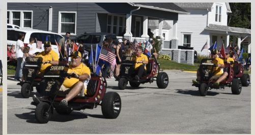
Summer Fun & Parading!