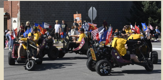
Madrid Labor Day Parade September 2, 2024