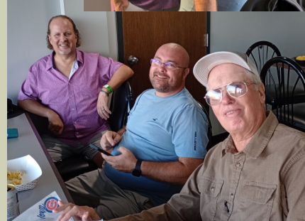
They were able to enjoy a game from one of the Skyboxes.